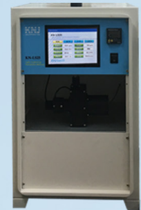
Light Scattering Analyzer KN-LS25