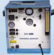
KNJ200 Gas Sampler